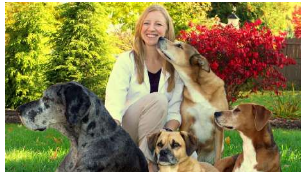
Story on page 6