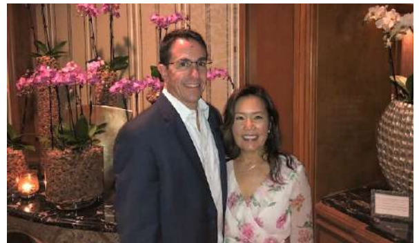
Story on page 5