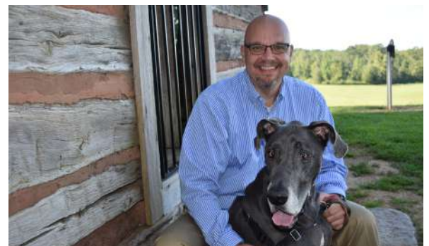
Story on page 7